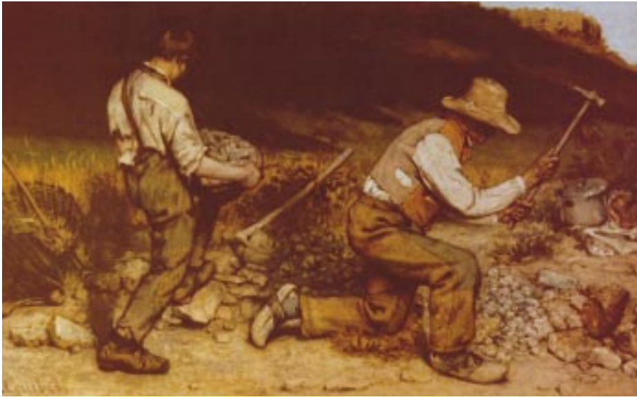
GUSTAVE COURBET, THE STONEBREAKERS . Realism, largely developed by French painters, aimed at a lifelike portrayal of the daily activities of ordinary people. Gustave Courbet was the most famous of the Realist artists. As is evident in The Stonebreakers , he sought to portray things as they really appear. He shows an old road builder and his young assistant in their tattered clothes, engrossed in their dreary work of breaking stones to construct a road.

JEAN-FRANÇOIS MILLET, THE GLEANERS . Jean-François Millet, another prominent French Realist painter, took a special interest in the daily activities of French peasants, although he tended to transform his peasants into heroic figures who dominated their environment.